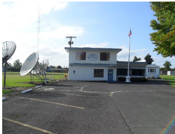
KORE radio station

I slept overnight in Eugene and the next day tried to find these important historical sites - some I found but others I couldn't - I took photographs of those that I did find such as 4th Avenue (where the Armstrong's lived), 8th Avenue (where first church building was located), Amtrak Station (where many broadcasts were recorded), Hult building (site of first home office, now replaced by the Hult), Royal Street (where the Firbutte Hall is supposed to be located but I could not find), the Odd Fellows Building that had a room HWA operated out of at one time and KORE radio station that broadcast HWA's programs.