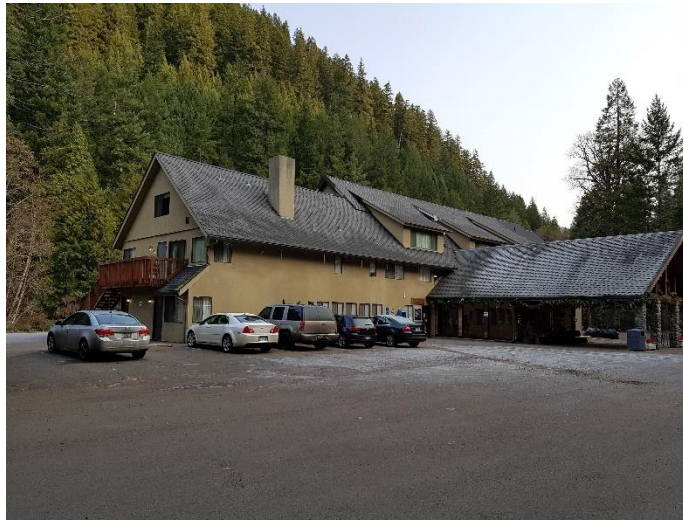
Belknap Springs resort